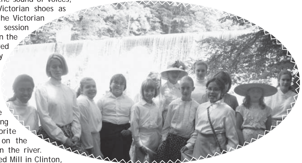
Attendees of the Victorian Days Summer Camp enjoyed picturesque Lake Solitude Dam as young ladies of the era once did.