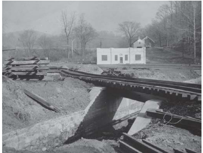
Lake Solitude hydro-electric power plant structure circa 1930. Lake Solitude and Solitude House in the background.

With the cold winter months finally coming to a close, all of us at the UFHA and our volunteers are looking forward to another productive season and the completion of our many projects that are currently in the works. Although the Museum is technically closed during the winter months, we find that our off season is the time we historically catch up on our paperwork, schedule our special tours and speaking engagements, seek out grants and continue on our interior restoration of the Solitude House. As anyone who owns or has worked on old structures can attest, the challenges of continual maintenance and costs are never in short supply. With a town as deep-rooted in history and historic structures as High Bridge is, the challenge is not just limited to restoration, but encompasses developing adaptive re-uses for our structures that meet the needs of this century and beyond. What some might not consider a "structure" but still in need of restoration and remediation are the Lake Solitude dam and spillway structures. With the State-mandated remediation of the dam scheduled to start this year, a new chapter in the long and colorful history of Lake Solitude is about to be written. Before moving forward, a look back at the history and significance of Lake Solitude is timely.